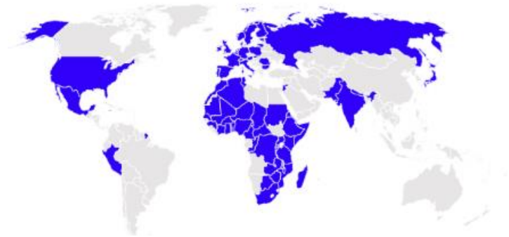
Figure: Countries represented in the event.

They originated from 45 African countries and 32 European countries.